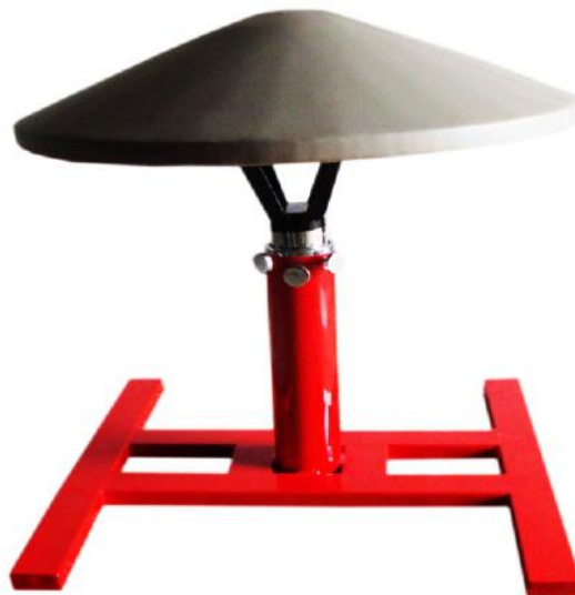
GAGM-003 Mushroom Horse Training