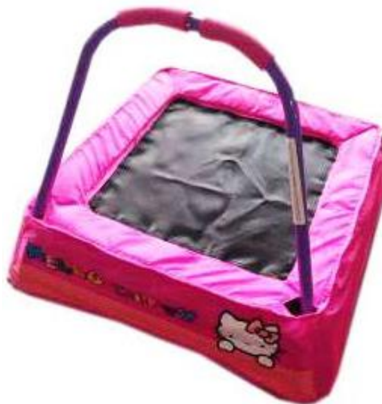
GAGM-0018 Mini Trampoline