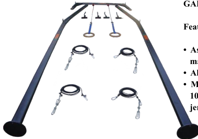
GAF-004 Roman Ring Apparatus