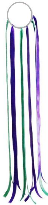
GAGM-0016 Dancing Hoop/Ribbon Dancing Hoop