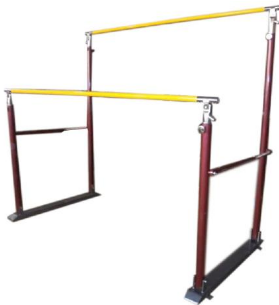
GAGM-0013 Uneven Bar