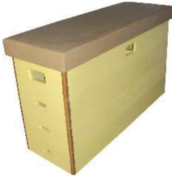
GAGM-001 Vaulting Box Wooden