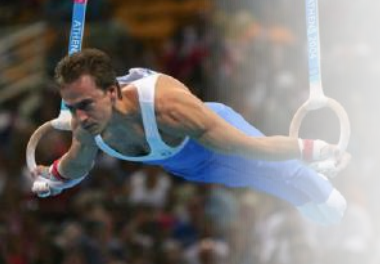
GAGM-005 Pommel Horse