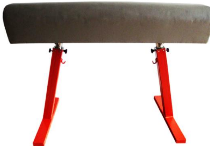
GAGM-006 Vaulting Horse