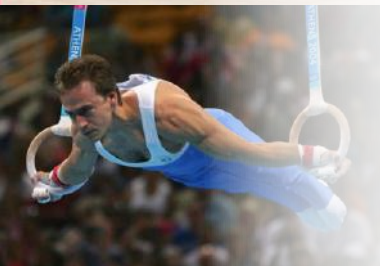
GAGM-00014 Vaulting Table