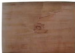
Crack in Blade