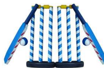
GACR-054 Toddler's Cricket Set

Indoor outdoors anywhere. 2 sets of stumps, 2 bats, 2 balls & 4 bails with carry bag. SAFETY first and foremost, made of EVA non toxic material.