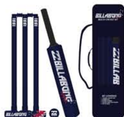
GACR-052 Beach cricket Set

P.V.C cricket set includes 3 stumps, base, hollow ball, 2 bails & bat. Ideal for beach cricket. Comes with carry bag.