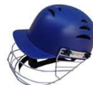
GACR-047 Club Cricket Helmet

Polypropylene construction, rounded peak for increased vision. Multi airflow ventilation, adjustable mild steel grill. Improved comfort fit. Value for money helmet. Sizes: S to XXL. Various colours.