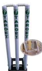
GACR-050 Target Wooden Spring Return Stumps with metal base

3 wooden stumps on heavy metal base with spring retraction complete with bails. Ideal for Training, Bowling and Fielding drills. Essential for cricket nets.