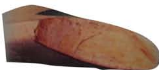
Crack in Toe