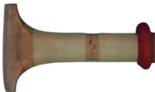
Crack in Handle

GAMA does the initial preparation only, you must continue the work until the bat is ready for practice and match play. (See steps below, once you have received your bat from us)