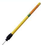
GACR-048 Target P.V.C Spring Return Stump

P.V.C Stump Spring loaded with metal spike to push into ground. Assists bowling, fielding, team drills. Fantastic target for bowlers. Great training aid. Available in senior & junior size.