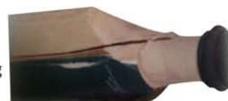
Crack in Shoulder

We highly recommend the use of this sleeve on your bat. This clear sleeve is the best protection for the face and edges of cricket bats. it is widely used by Test & First Class cricketers