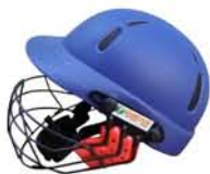
GACR-044 Test Cricket Helmet

Light weight yet high impact polypropylene moulded shell with EPS liner provides stronger impact absorption, with greater ventilation, open cell foam pads inside helmet for comfort & stability. Injection moulded shell for impact absorption. Full face adjustable grill. Rounded peak for increased vision. Quick release chin strap with sweat absorbent chin cup. Hard drawn low carbon(HDLC) faceguard is 25% lighter. Mens size