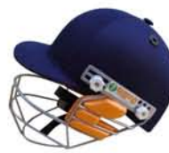
GACR-046 County Cricket Helmet

Fibre glass shell cloth covered. Adjustable mild steel grill. Quick release chin strap with sweat absorbent chin cup. Adjustable comfort pads for exact fit. Sizes: S to XXL. Various colours.