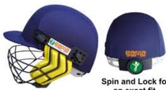
GACR-045 League Cricket Helmet

Heavy duty helmet made from injection moulded ABS Shell. Spin and lock mechanism enables the user to fit the helmet to their exact head size. Cloth Covered and adjustable mild steel grill. Open cell foam pads inside helmet increase comfort & stability. Quick release chin strap with sweat absorbent chin cup. Hard drawn low carbon(HDLC) faceguard is 25% lighter. Mens size. Various colour